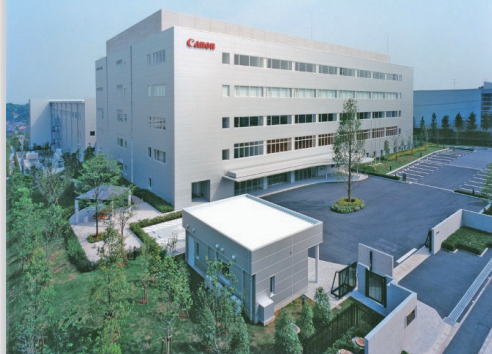
Headquarters (Kanagawa pref.)